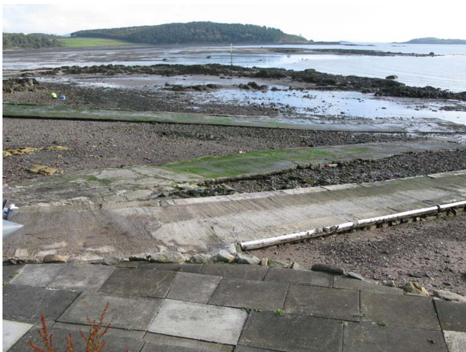
Figure 14. The lower shore in the Slipways zone and reefs at the border with the Boat Area zone