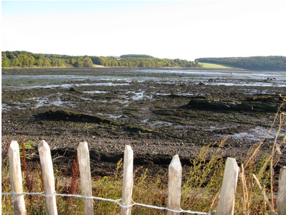
Figure 12. Extensive areas of shore exposed at low tide in front of the Fenced Area