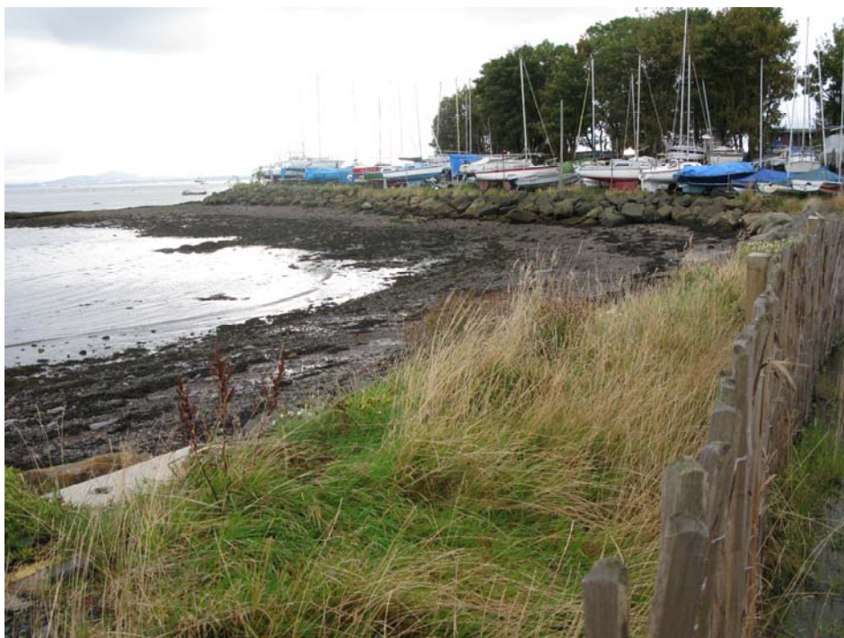
Figure 11. The Boat Area zone and the Fenced Area zone

The lower shore between the North End zone and the Boat Area zone was a large expanse of mud flats with scattered boulders and stones that stretched out into the bay. Extensive areas were exposed at low tide and many parts were covered with seaweed and algal mats. Small patches of bedrock were scattered across the upper and lower shore in the Fenced Area zone (see Figure 12) and larger outcrops of bedrock, interspersed with patches of mud, sand and stones, extended out across the shore at the eastern end of the Boat Area zone and into the northern part of the Slipways zone.