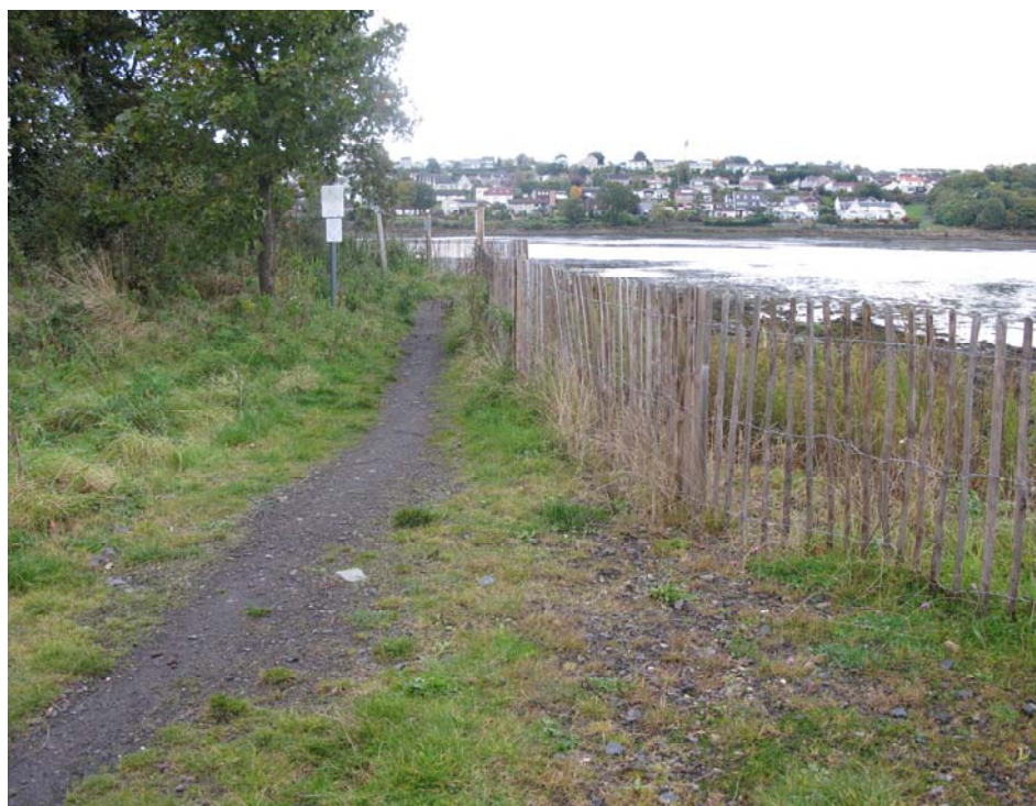
Figure 5. The path by the Fenced Area zone

Immediately to the south of the Slipways zone, the Headland zone was a large area of cut grass (see Figure 6) that could be reached from paths and tracks through the sailing club grounds or across other grass areas from The Wynd. The seaward side of the headland was faced with a steep boulder embankment that prevented easy direct access to the shore, although towards the south-west end there was a rocky outcrop next to the embankment that allowed agile individuals to get down to the shore below. At low tide it was possible to walk along the shore to the headland from the slipways area.