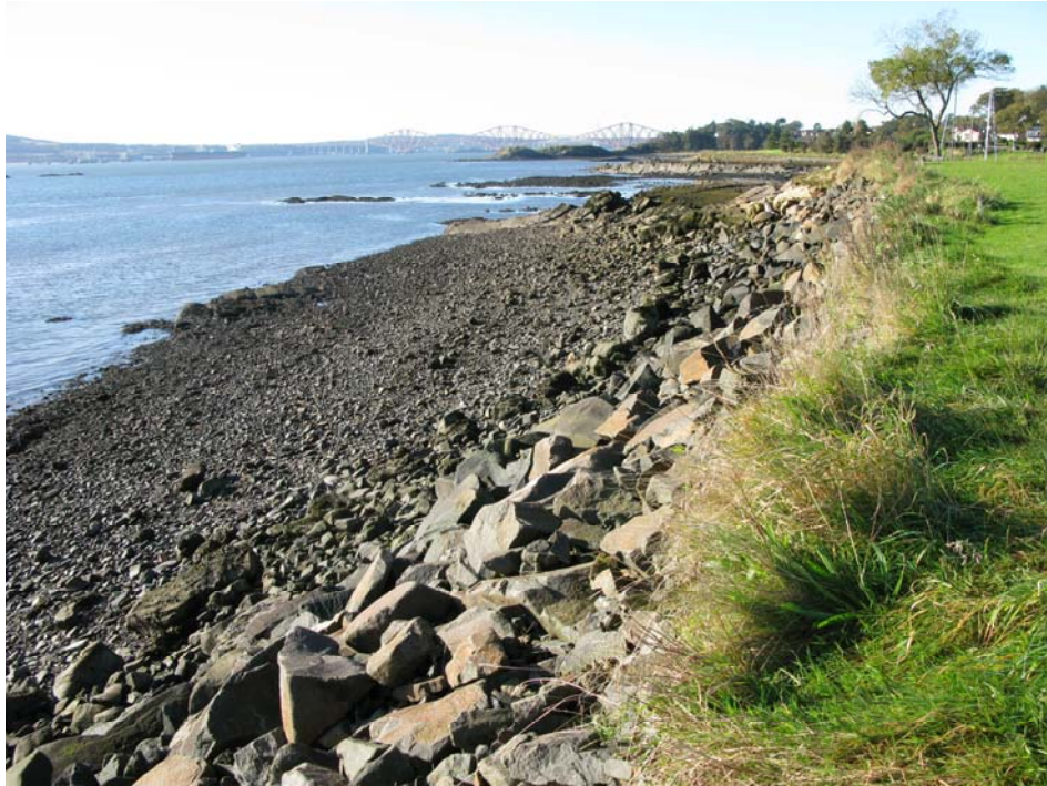
Figure 15. The shore in front of The Headland zone