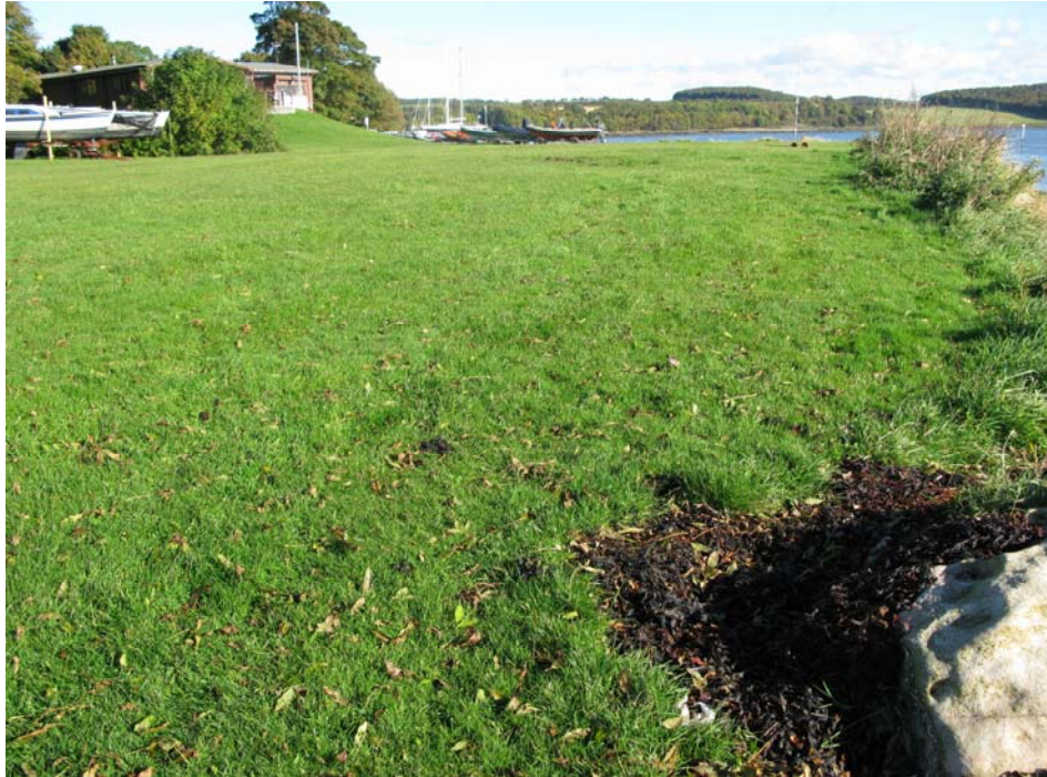
Figure 6. The Headland