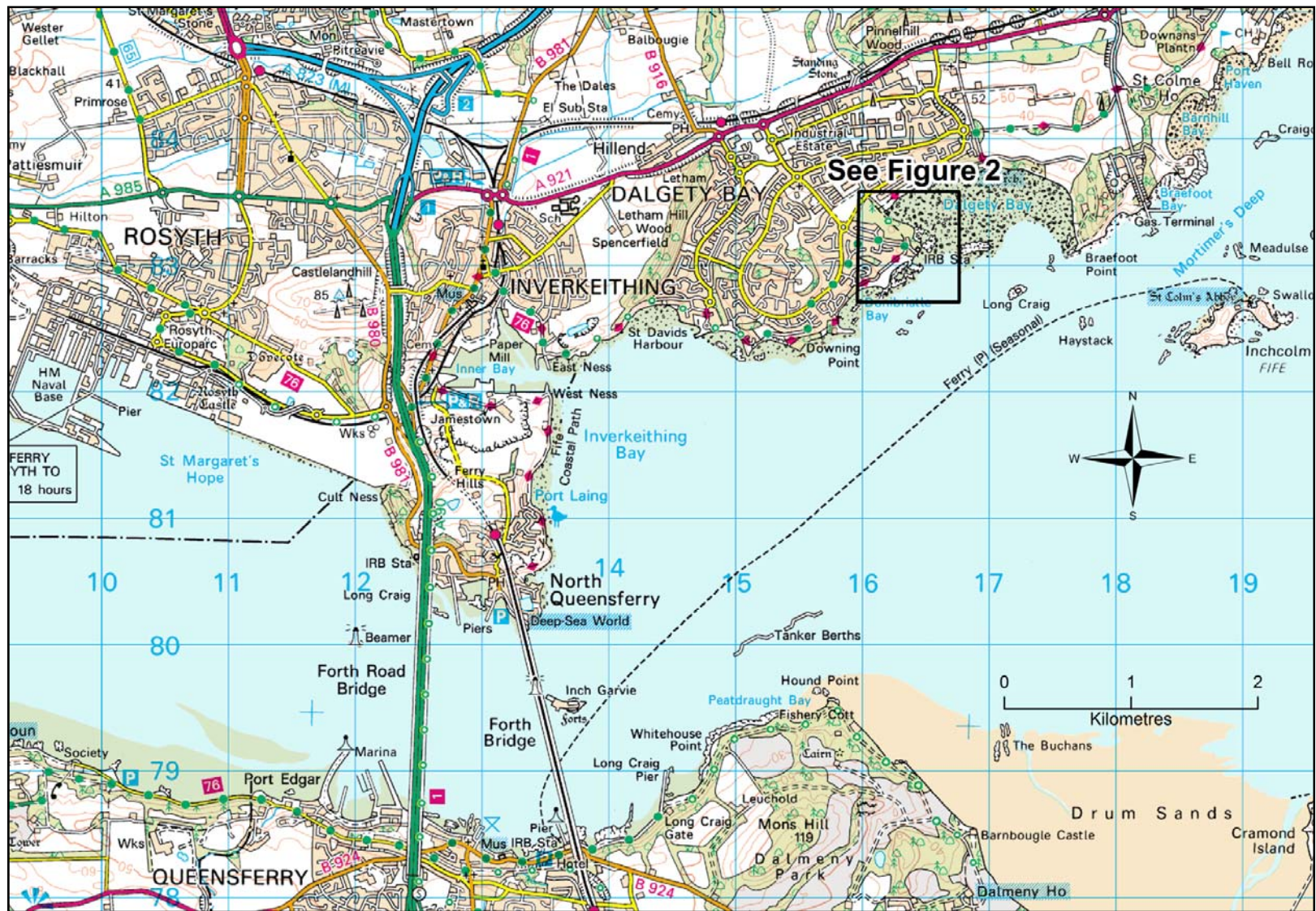
Figure 1. The location of the survey area