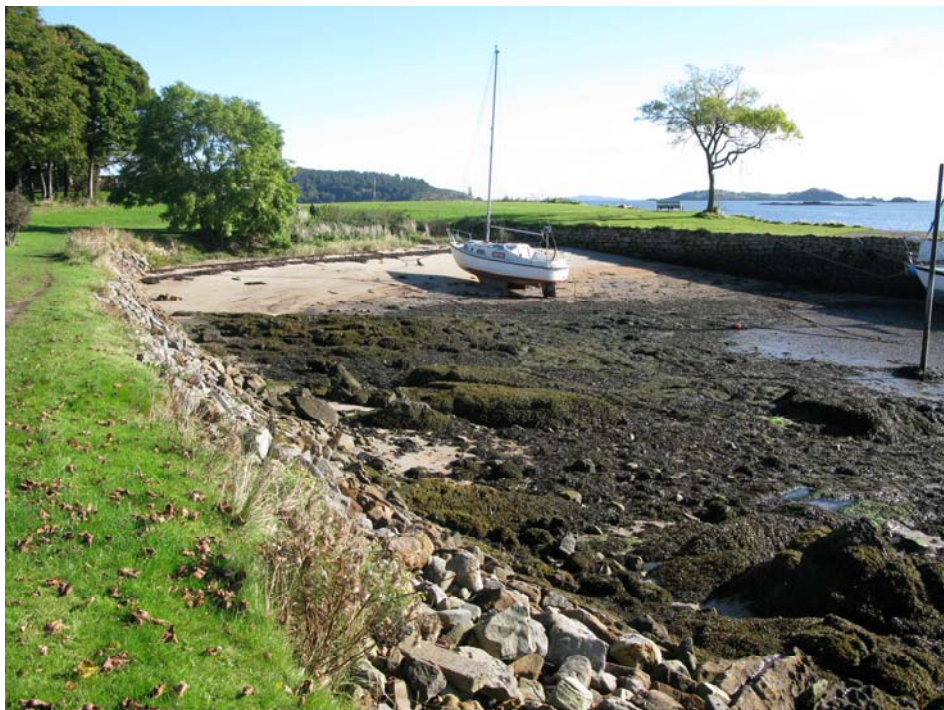
Figure 16. The New Harbour zone