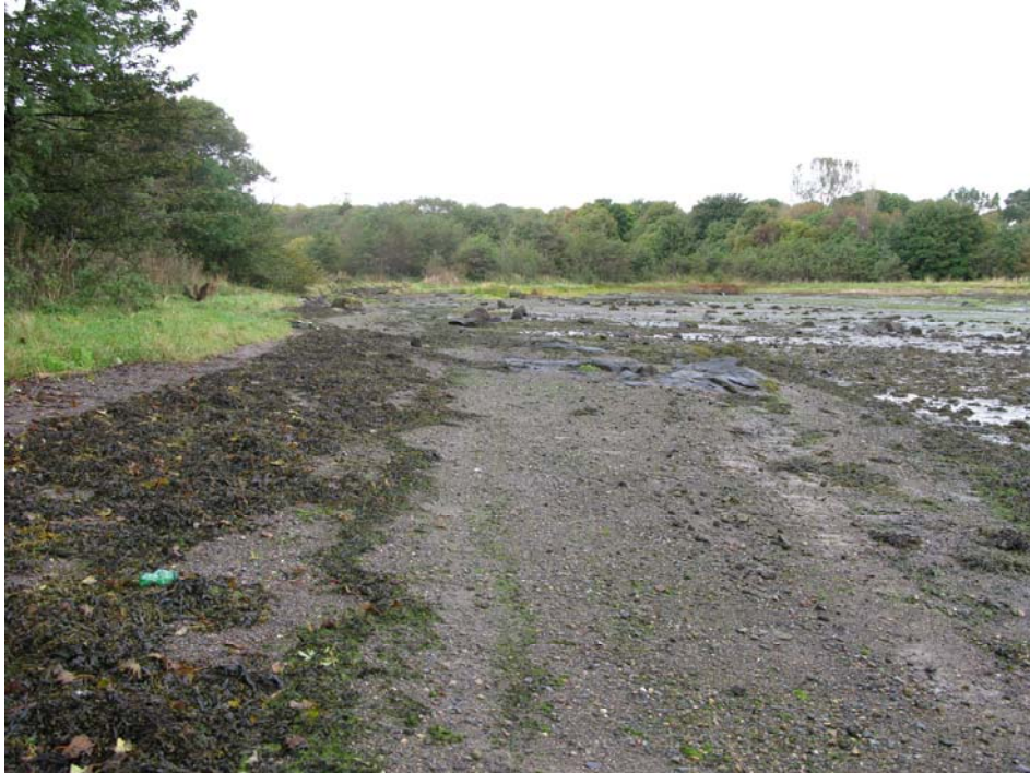
Figure 9. The Ross Plantation zone, looking towards the north-west

other building materials and wave worn pieces of broken glass and crockery mixed in with the natural materials of the beach. At the time of the survey, large amounts of loose seaweed had been washed up on the beach.