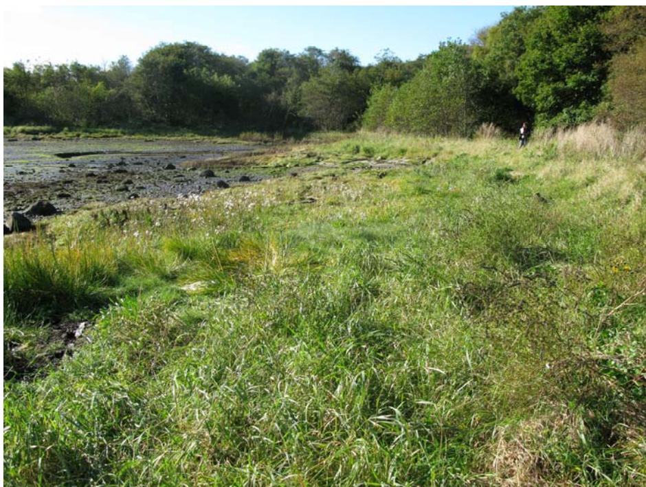
Figure 7. The North End zone with the northern part of the Ross Plantation zone in the background