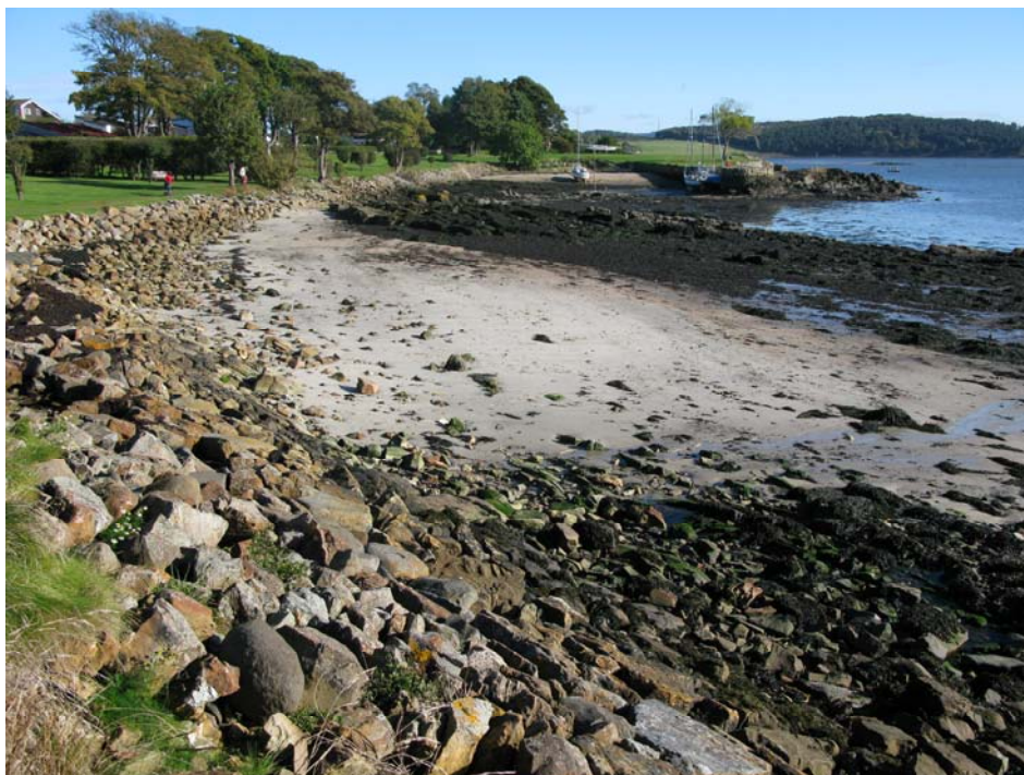
Figure 17. The West End zone with the New Harbour zone in the background

The upper shore of seaweed covered boulders and bedrock continued into the West End zone but there was a small golden sand beach along the upper shore in the centre of the zone (see Figure 17). The lower shore throughout the zone was similar to the New Harbour zone; a complex patchwork of bedrock, boulders, stones, sand and mud, with many areas overgrown with seaweed.