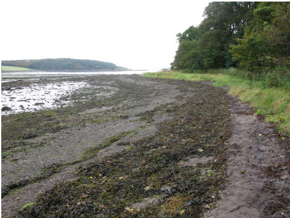
Figure 10. The Ross Plantation zone, looking towards the south-east