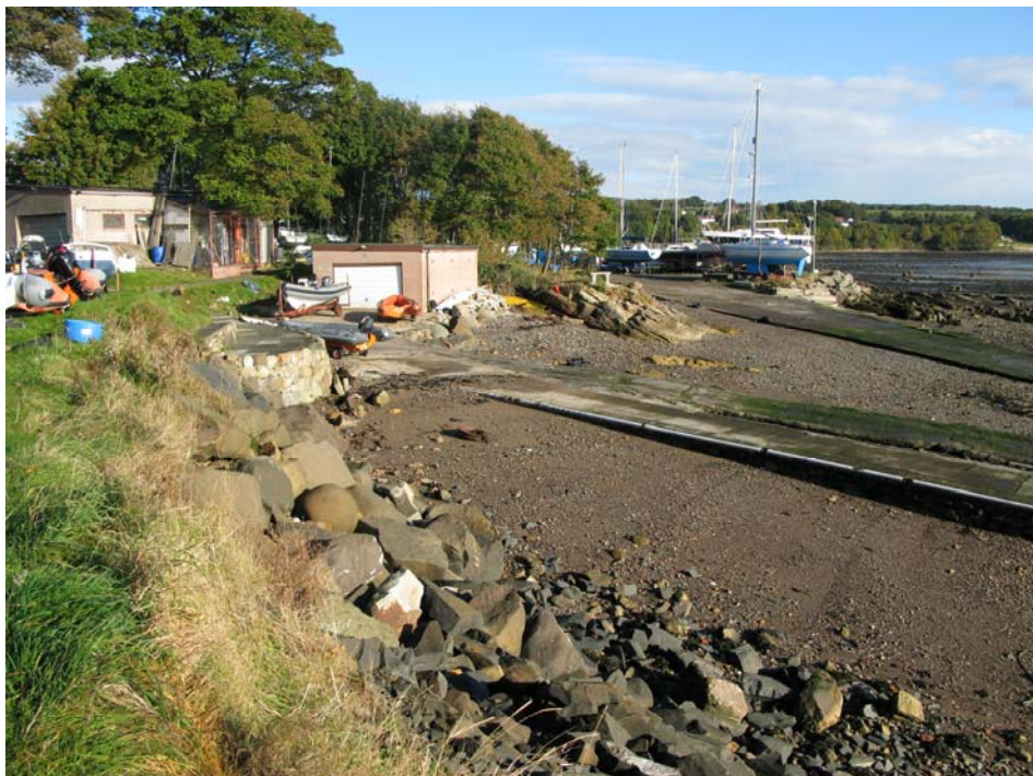
Figure 13. The upper shore in the Slipways zone