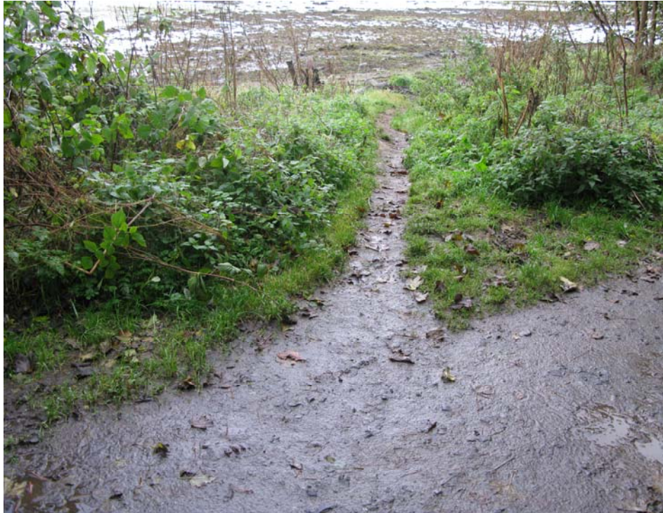
Figure 4. One of the minor paths between the Fife Coastal Path and the shore in the Ross Plantation zone

The Fenced Area zone was so called because a fence had been erected at the top of a low embankment at the top of the shore, preventing direct access to the shore in this area. The fence was erected due to the discovery of high activity particles in this area and signs were in place advising the public not to go onto the shore in this area. At the northern end of the fenced area a barrier extended down the shore perpendicular to the fence, but this was only a few metres long and, except at high tide, it was possible to gain easy access to the shore in front of the fenced area by walking along the shore from the Ross Plantation zone, below the barrier. It was also possible to access the shore at the south end of the fenced area by going around the end of the fence and down a low embankment. An earth path ran behind the fence, (see Figure 5) between the shore at the south end of the Ross Plantation zone and the track in the Boat Area zone.