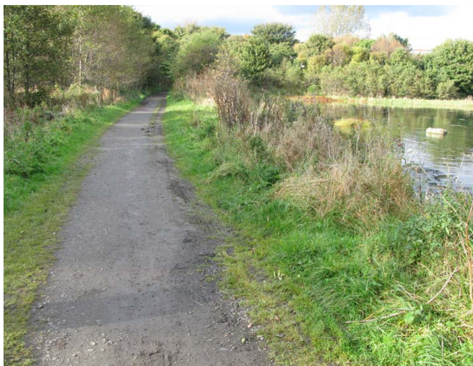
Figure 3. The Fife Coastal Path where it passes close to the shore at the northern end of the Ross Plantation zone

The Fife Coastal Path, which had a surface of compacted crushed stone, entered the survey area from the east and passed close to the shore through the North End zone. It continued through the Ross Plantation zone (see Figure 3), gradually veering inland to join The Wynd. Other paths from the road at Moray Way South and from The Spinneys joined the Fife Coastal Path near the northern end of the Ross Plantation zone. For the most part the Fife Coastal Path was separated from the shore by a band of trees and undergrowth but there was a small area of open grass, just a few metres long, between the Fife Coastal Path and the shore, close to the point where the path from The Spinneys joined the coastal path. Several minor paths cut through the band of trees and undergrowth to allow access from the Fife Coastal Path to the shore in the North End and Ross Plantation zones (see Figure 4). Other minor paths passed through over 100 m of woodland between the part of the Fife Coastal Path near to The Wynd and the Fenced Area zone.