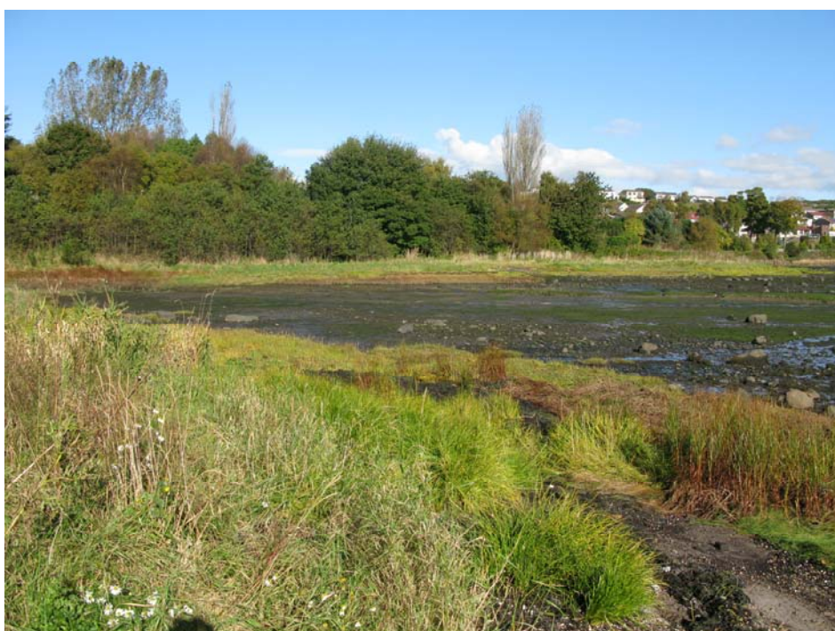
Figure 8. The northern part of the Ross Plantation zone with the North End zone in the background

A beach, composed mainly of small stones with a little coarse sand, extended along the upper shore through most of the Ross Plantation Zone (see Figure 9 and 10), the Fenced Area zone and the Boat Area zone (see Figure 11). There were noticeable amounts of manmade materials such as bricks,